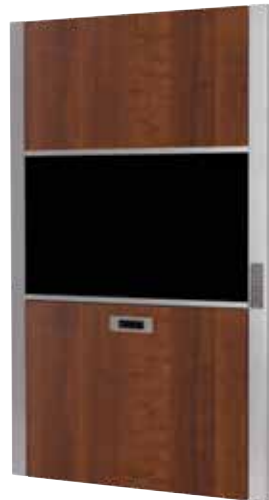
430 Wall Cabinet Workstation