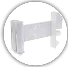
LCD Access Pack for med cups, tape and alcohol wipes 4170088