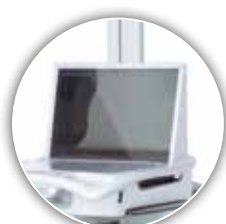
OR Splash Guard for laptops** M06044901

* Available for M38 RX only. ** For use on laptop cart only. *** Mounting Bracket only - Caviwipes Bracket sold separately.