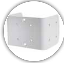
3 Sided Mounting Bracket 9M06027501