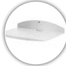
Large Printer Shelf 15" w x 9" d 9M38-RL