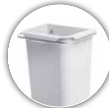
Trash Bin 9M38-WB