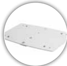
Mounting Plate for Sharps Brackets and Accessory Bins 9M06026001