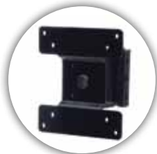
Rotating Monitor Bracket 9M38-MR