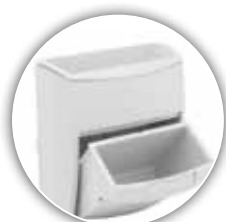
M38 RX Locking Side Bin with removable bins* 9M06038501