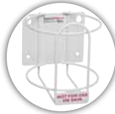
Mounting Bracket for Caviwipes Bracket*** 4170398