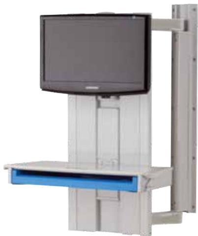
Premium Tandem Arm™

The Tandem Arm™ and Slim Line Wall Mounted Workstations are designed to promote a professional appearance specific to healthcare environments. Dual arms moving in tandem provide best-in-class stability and range of motion; while the work surface facilitates med preparation and supply accessibility. Now available in select finishes (see page 10 for details).