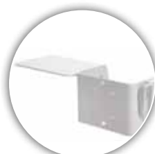
Barcode Scanner Charging Station Shelf Inquire for model number