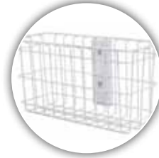
Wire Basket 9M38-AA