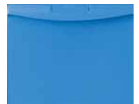
1779309 Pharmacy Robot Envelope Drawer