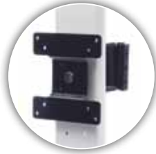
Rotating 5" Height Adjustment Monitor Bracket 4170096