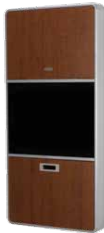
423 Wall Cabinet Workstation

The Wall Cabinet Workstation is designed to provide maximum aesthetic flexibility and best-in-class performance. Innovative features, advanced keyless entry system, and exceptional serviceability make our Wall Cabinets the best choice for your demanding clinical environment.