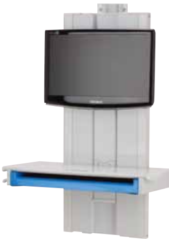
Premium Slim Line